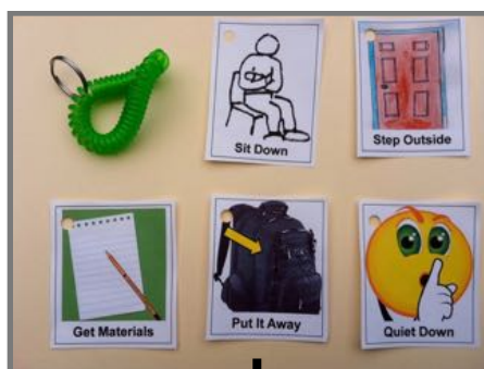
Small images carried on a key ring or lanyard