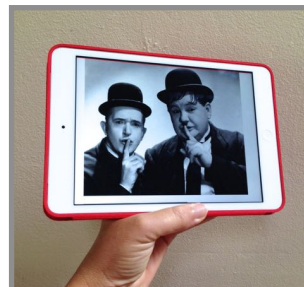
Digital images carried on an iPad